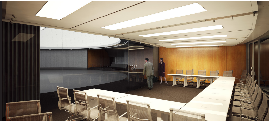
GM Design Dome - SmithGroup JJR Rendering Boardroom / Conference Room