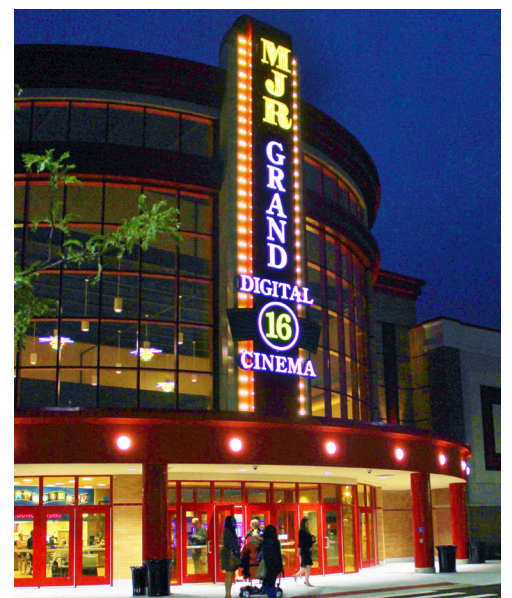
MJR Troy Grand Opening